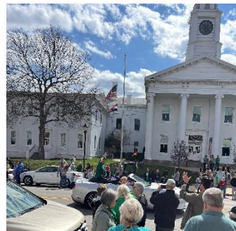
A CHAMBER OF COMMERCE DAY